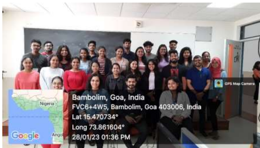
Photo: Day 2- Data Analysis using EViews