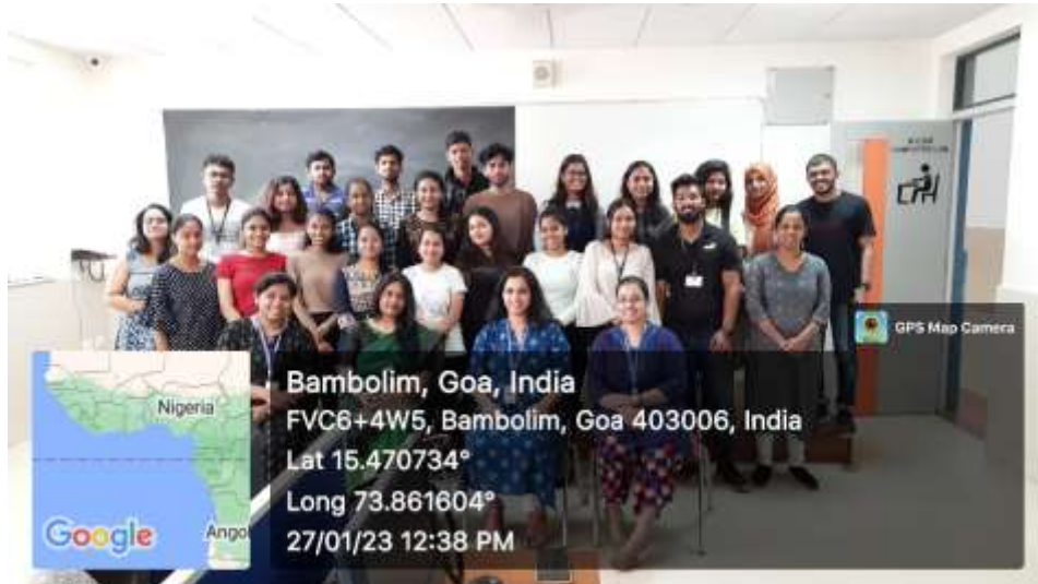
Photo: Day 1- Data Analysis using Jamovi