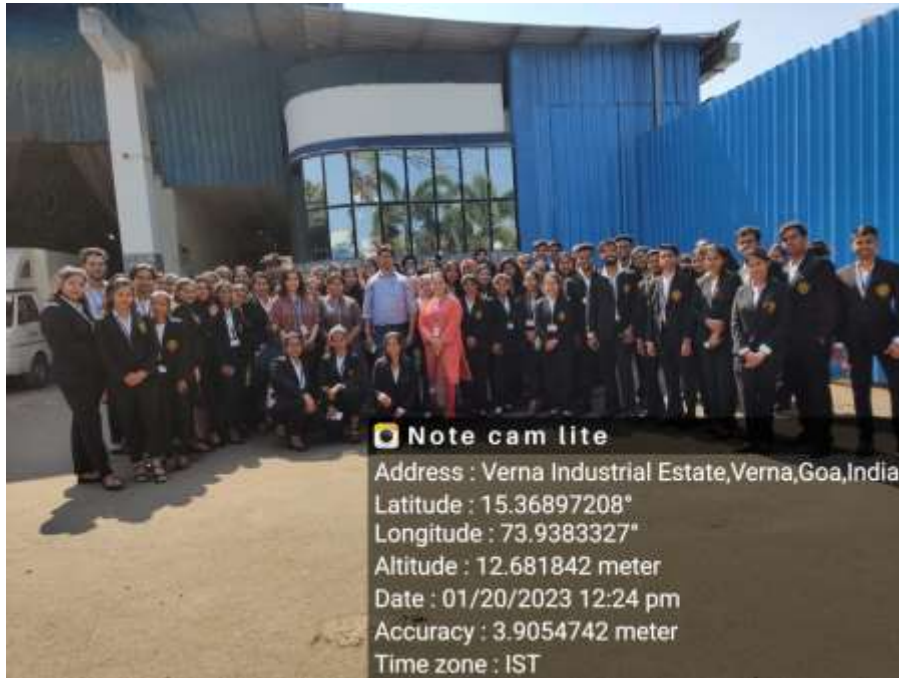
Photo: MCom students at Digisol -Smartlink Network Systems Ltd